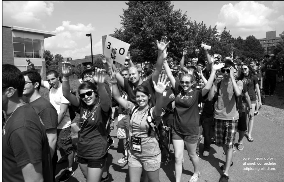
Lorem ipsum dolor sit amet, consectetur adipiscing elit diam.